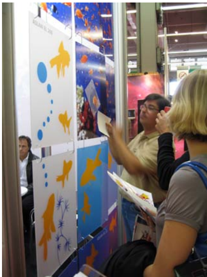
Try Dryapply! Visitors gave the new glass decoration film in sandblasting look directly a trial