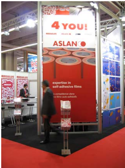
ASLAN – innovative films for you!