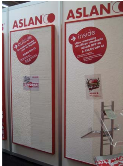
New ASLAN digital printing films for indoor- und weather-resistant outdoor applications