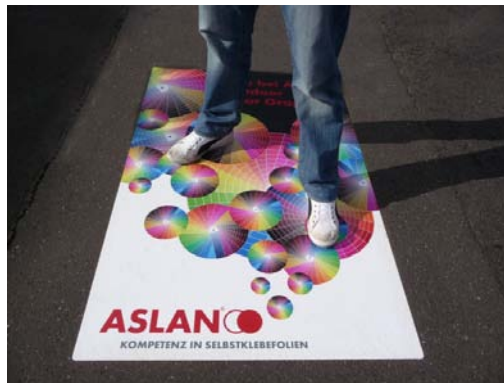
Application of the ASLAN Outdoor Floor Graphics Package